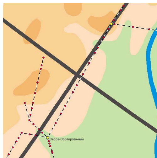
Figure 4. Added transit points