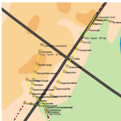
Figure 3. Initial railroad points map